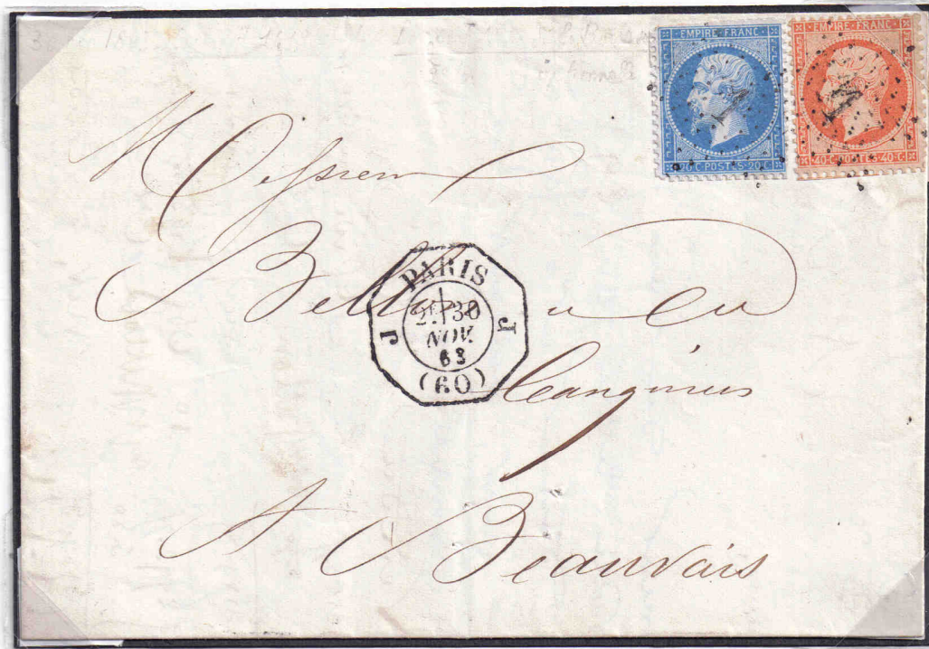
30 November 1863 Office J Place de la Bourse 20c inland+40c second late fee period