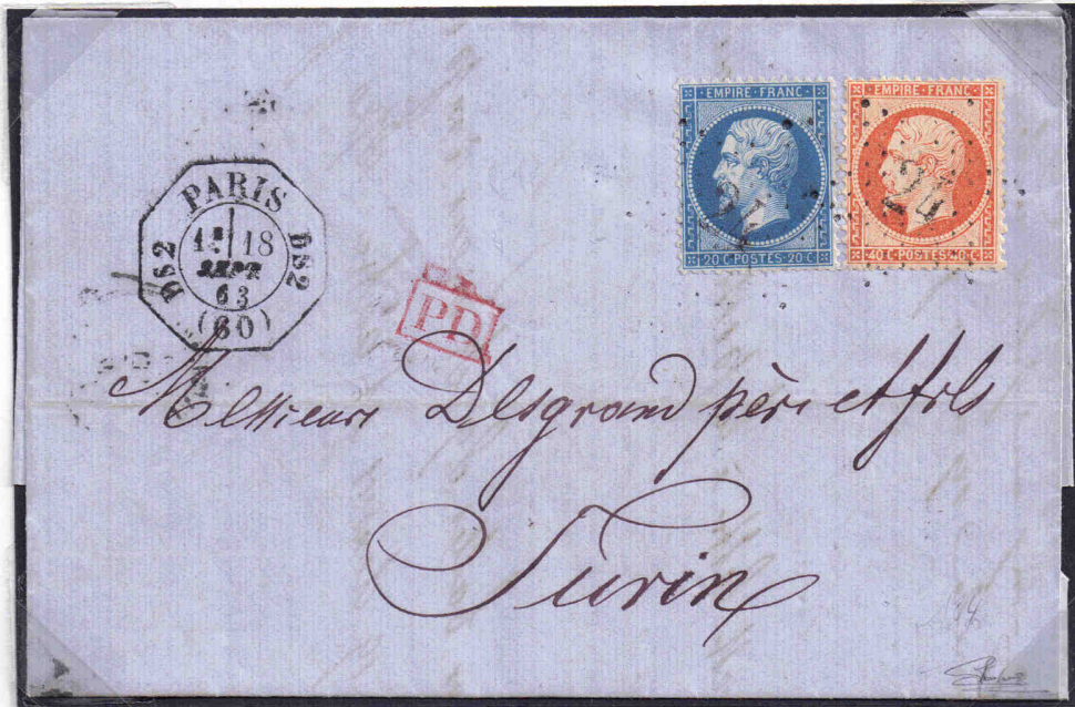
18 September 1863 Office DS2 rue de Cléry to Italy 40c foreign+20c first late fee period

In September 1863 office DS2 was renumbered 24 but retained its DS2 date stamp, only in 1865 did it receive one with its address