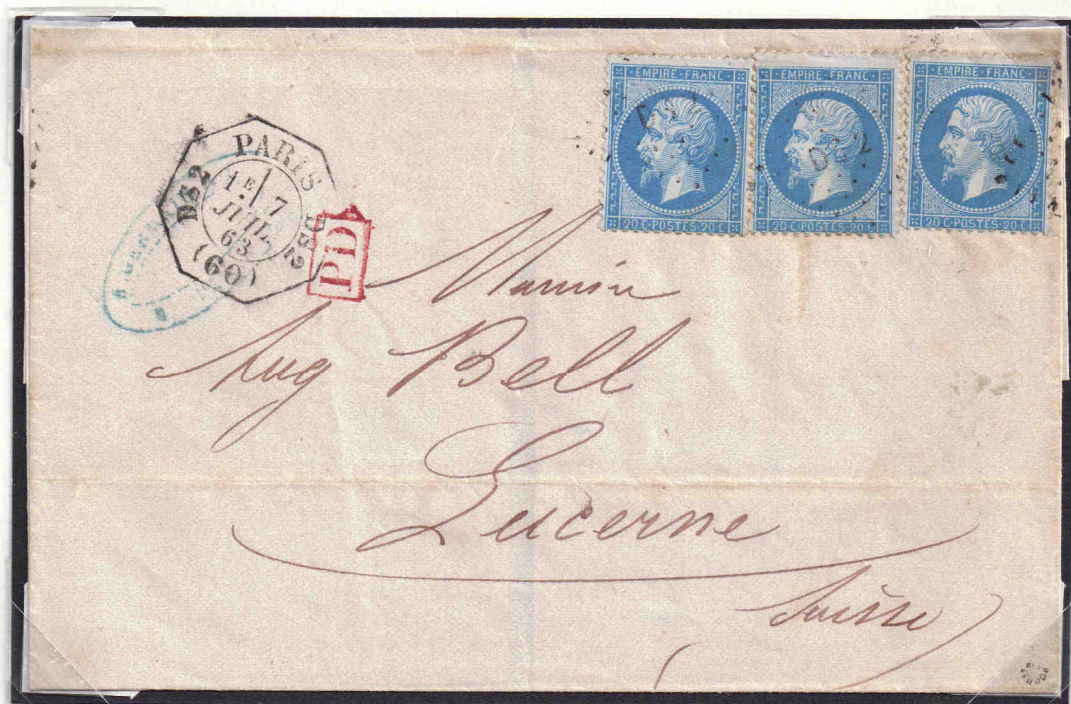
Office DS2 rue de Cléry 7 July 1863 to Switzerland